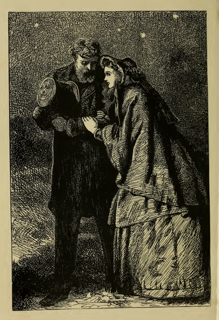
WITH ESTELLA AFTER ALL.